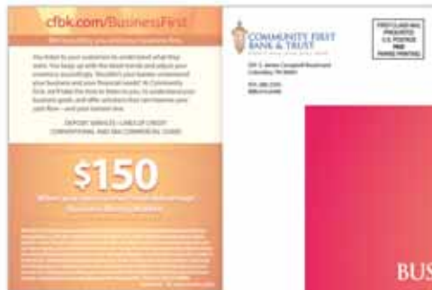
6" x 9" Postcard