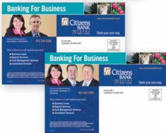
6" x 9" Postcard