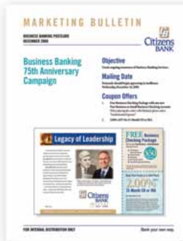
8.5" x 11" Marketing Bulletin