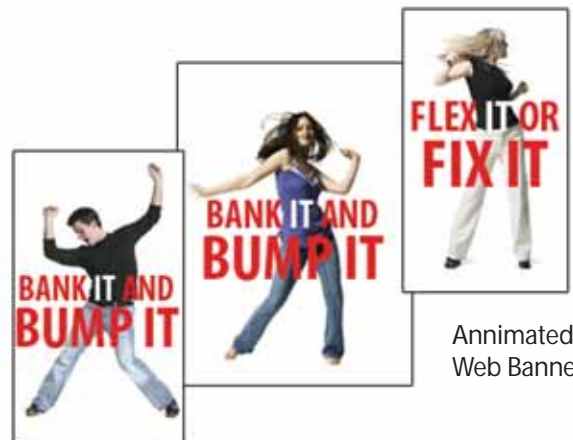
Animated Web Banners