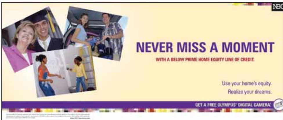
66" x 28" Merchandising Poster