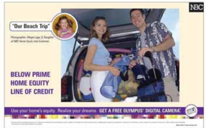
44" x 28" Merchandising Posters