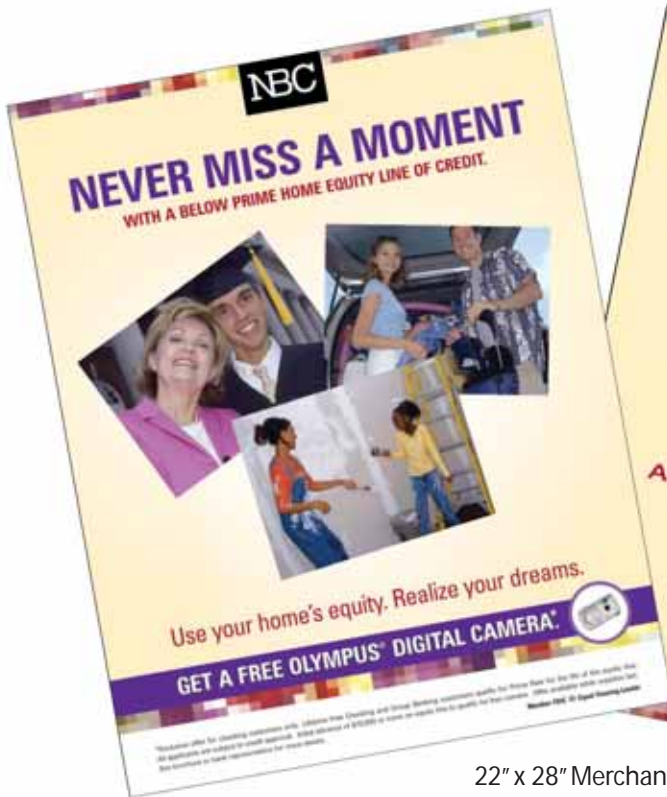
22" x 28" Merchandising Poster