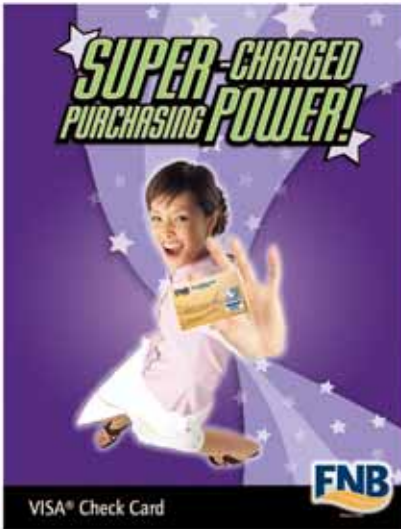
22" x 28" Merchandising Inserts