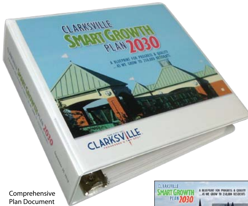
Comprehensive Plan Document