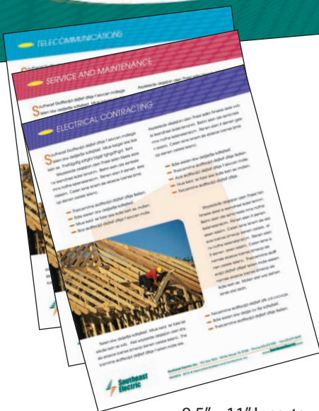
8.5" x 11" Inserts