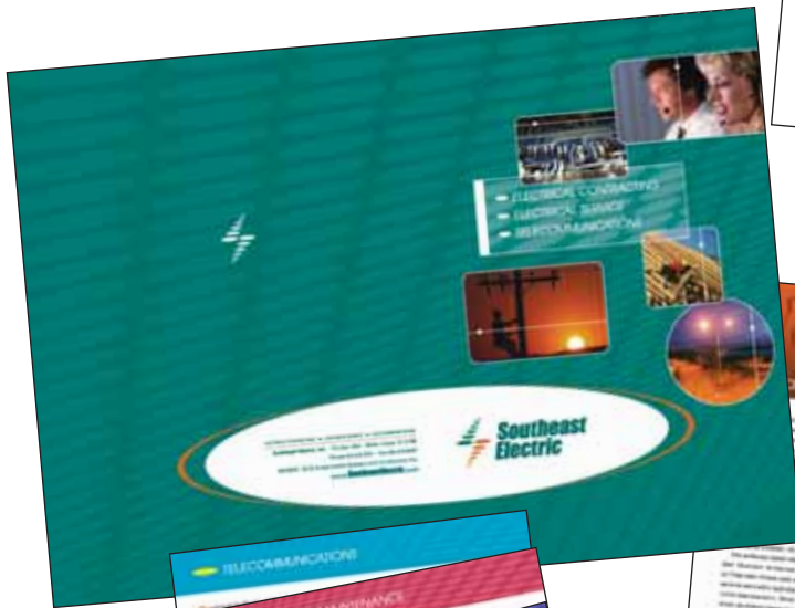
9" x 12" Presentation Folder