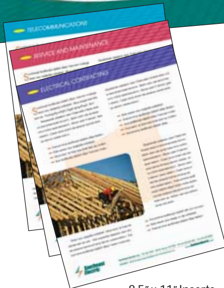
8.5" x 11" Inserts